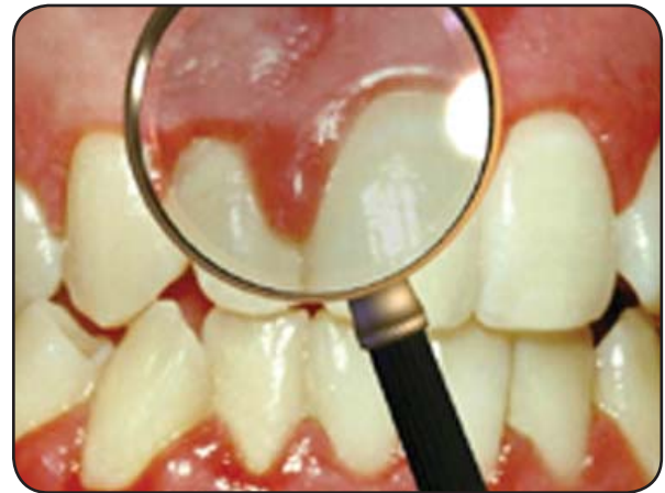
Inflamed and swollen gums

It is also possible to have no noticeable symptoms. In fact, most people who have periodontal disease are not even aware of it.